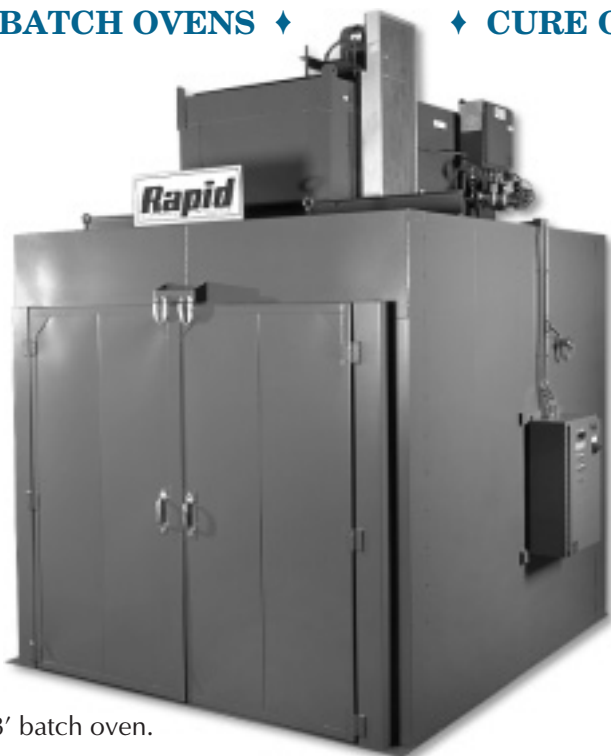
An 8'x8'x8' batch oven.